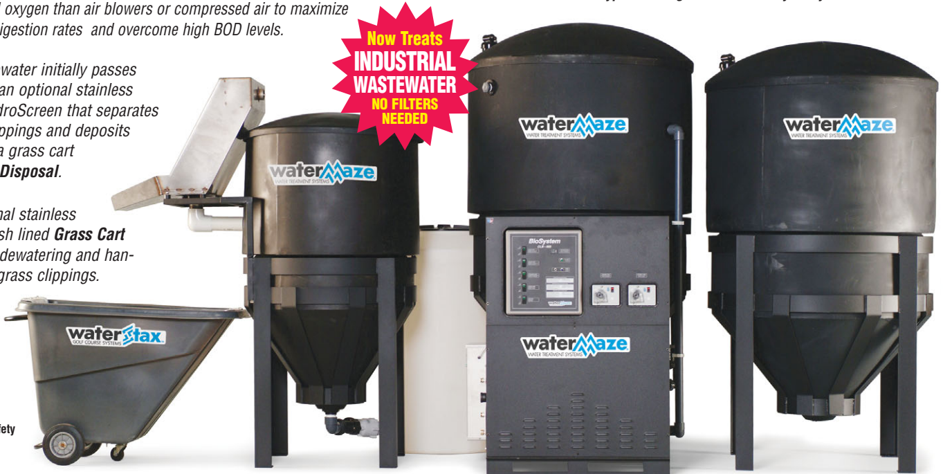
Optional cart for easy disposal of grass clippings